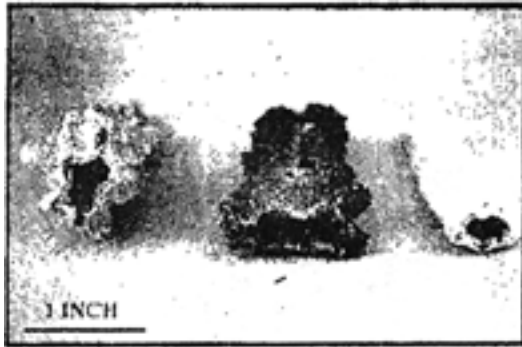
Minerological Research Co.