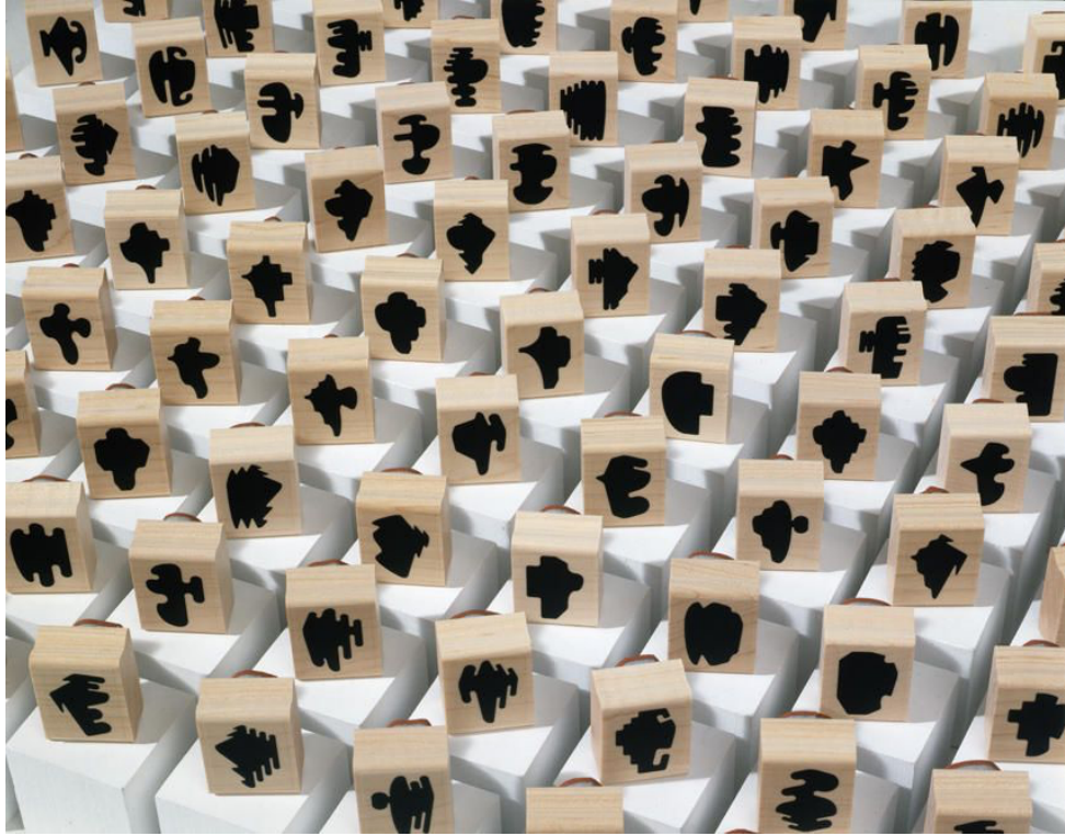
Shapes Rubber Stamps