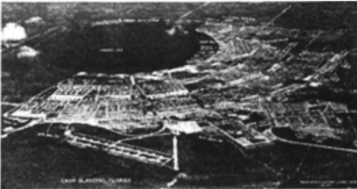
World War II aerial of Camp Blanding.

The E. I. Du Pont de Nemours and Co. mines a restricted area on the western edge of the post where ilmenite and other heavy minerals are removed from the soil. The armory board uses the income from the sale of mineral rights and timber pro-