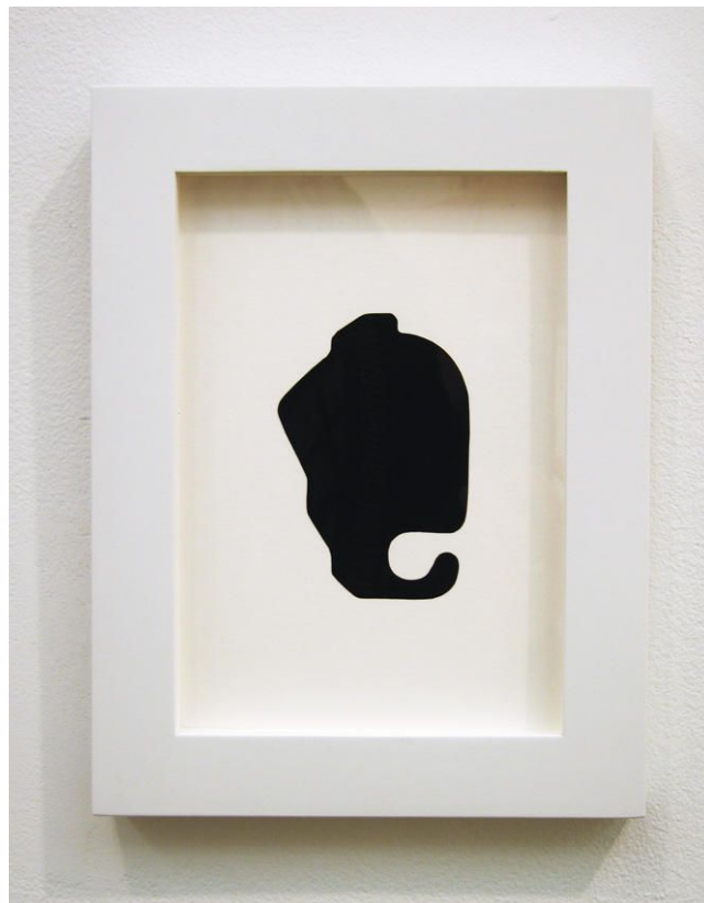
Allan McCollum The Shapes Project: Shapes From Maine Shapes Silhouettes 2005/2008

This will be Allan McCollum's fifth solo exhibition with Friedrich Petzel Gallery. The exhibition will open on Friday January 16th, with a reception from 6-8 p.m. and will be on view through February 14th. Friedrich Petzel Gallery is located at 535 West 22nd Street, New York, NY 10011. For more information, please contact the gallery at 212-680-9467 or info@petzel.com .