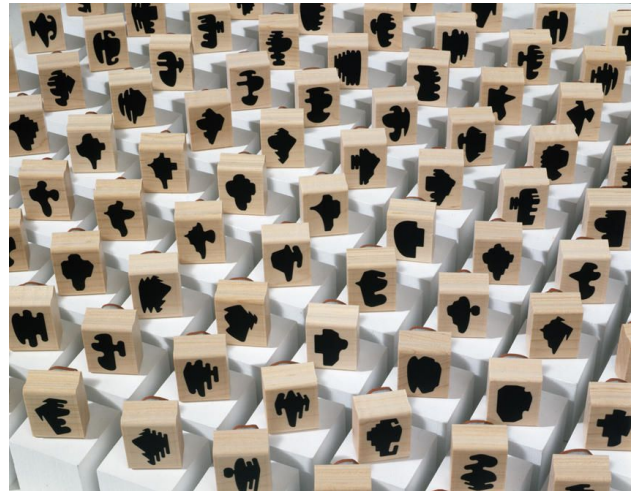
Allan McCollum The Shapes Project: Shapes From Maine Shapes Rubber Stamps 2005/2008

Throughout his forty-year career, Allan McCollum has wrestled with the vexed distinctions people make between objects created in quantity and objects created as singular; between objects that are deemed to be alike and objects that are deemed to be different; between objects made by hand and objects made with the aid of machines; between objects created at home and objects created in factories; between objects that come into being through the actions of an individual and objects that come into being through the actions of a group. The Shapes Project , is a project he specifically created to be larger than anything he could possibly complete by himself, or in his own lifetime. It has been his intention to have the project take many forms, and find expression through the ideas and actions of others.