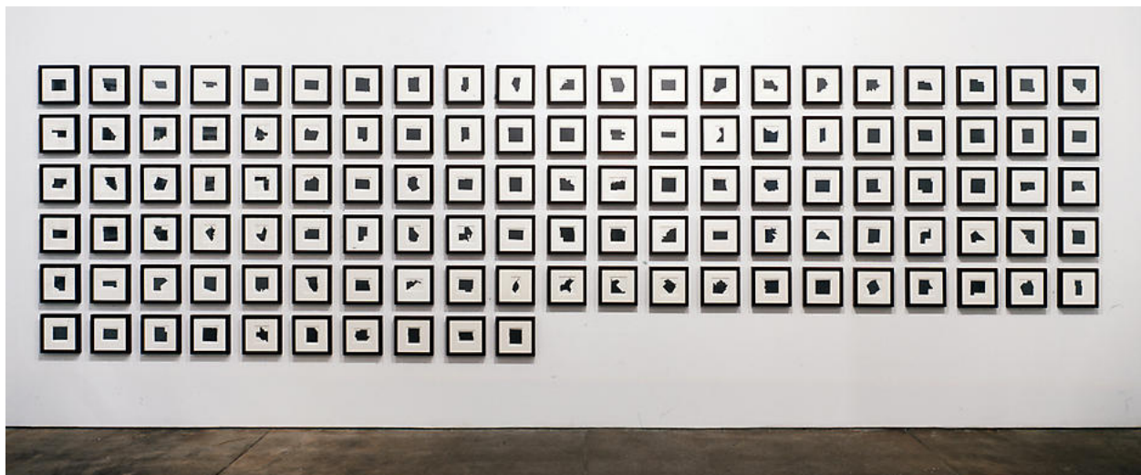
Recognizable Image Drawings: The Counties of Missouri, 2003. Graphic pencil on paper,

Within these projects, his curiosity about "recognizability" has evolved into a number of different forms as well. In his New City Markers of 2001 he created a symbolic system of aluminum emblems that were used to supplement street addresses for an entire neighborhood of over 1000 new apartments in Malmo, Sweden, thereby allowing every apartment dweller to recognize his or her own home by a visual symbol. With his Small World Drawings of 2000 and his Each and Every One of You print portfolio of 2004, he created projects that involved the production of thousands of individual artworks, each using a common given name (i.e. Mary, David, Sam, etc.), so as to employ the desire of the viewer to recognize his or her own name in the group.