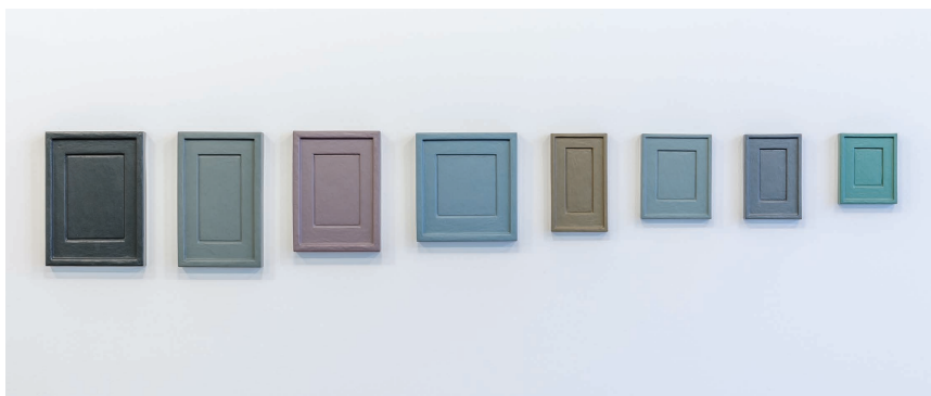
Details of the exhibition " À VENDRE, EXPOSITION " by Claude Rutault et Allan McCollum.

mfc-michèle didier 66 rue Notre-Dame de Nazareth, 75003 Paris, France T + 33 (0)1 71 27 34 41 - P + 33 (0)6 09 94 13 46 info@micheledidier.com - http://www.micheledidier.com