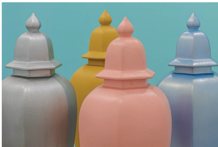
Views of the exhibition " À VENDRE, EXPOSITION " by Claude Rutault et Allan McCollum.