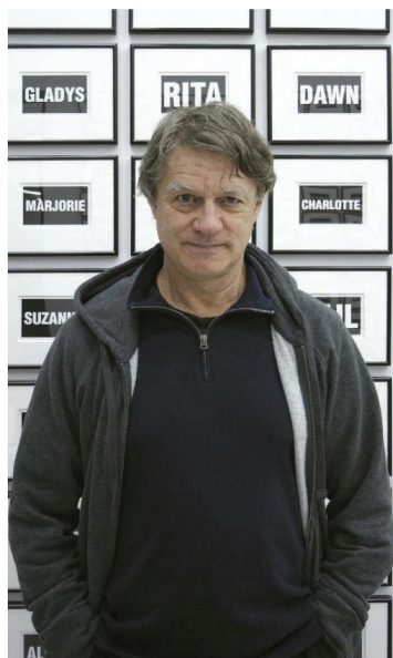
Portrait of Allan McCollum

DU 1 er AVRIL AU 18 JUIN 2016 S'ADRESSER ICI