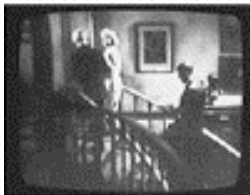
Allan McCollum. Surrogates on Location. 1982

But I think this is a very fragile security we're speaking of, and this gets into one of the main reasons I produce my work in such vast quantities and install so many in one exhibit. As I said before, I think the artwork and the consumer good are both a kind of intentionally designed fetish; I believe that you can only reduplicate the fetish so many times before the accumulation begins to turn on you, and the fetish becomes your persecutor: this is why all mass-produced objects have a certain ominous presence. I might like to have a Sony video recorder, but to come face-to-face with all the Sony video recorders in the world would be a truly terrifying experience – this I'm sure of. There's a certain point, like a critical mass, where the fear that animates the fetish-object submerges the safety it offers and works against it. I think the Sorcerer's Apprentice sequence of Disney's Fantasia depicted this sort of transformation from the helpful object to the object which threatens death. From the nurturing object to the persecuting object.