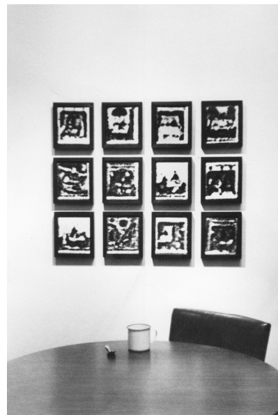
Allan McCollum. Twelve Perpetual Photos , 1982/84. Silver gelatin prints, each unique.

AM: Yes, the artwork is a kind of fetish – a kind of substitute for real power, or maybe I mean a kind of sign representing imaginary power. Like I said, we look at art for security, security against loss or death. I’ve tried to design these surrogates to invite a fetishistic attachment, the kind of attachment one might