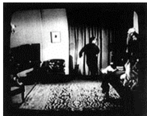
Allan McCollum. Source for Perpetual Photo No. 10 , 1982. Photo from TV.