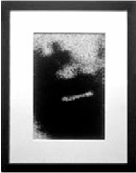
Allan McCollum. Perpetual Photo No. 4 , 1982.