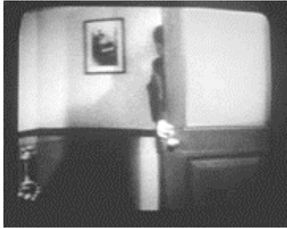
Allan McCollum. Source for Perpetual Photo No. 4 , 1982. Photo from TV.